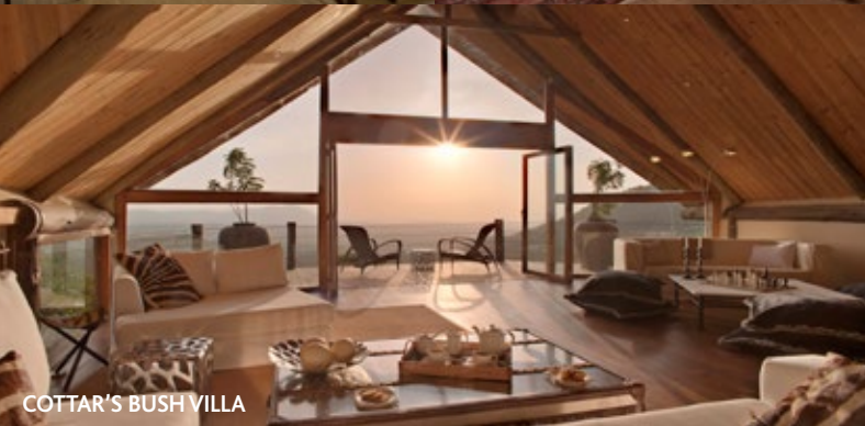
COTTAR'S BUSH VILLA